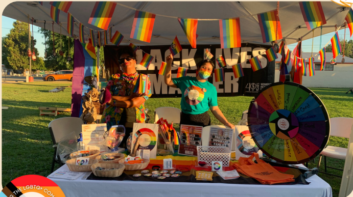
PRIDE MONTH SOLIDARITY AND LGBTQ LIBERATION