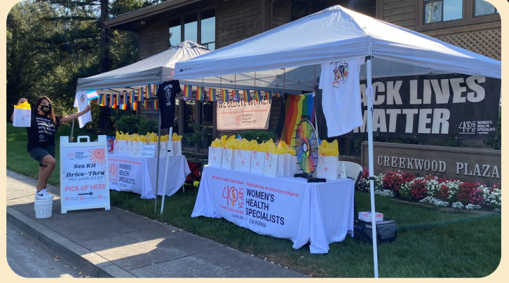
QUARANTINE SEX KIT DRIVE-THRU EVENTS