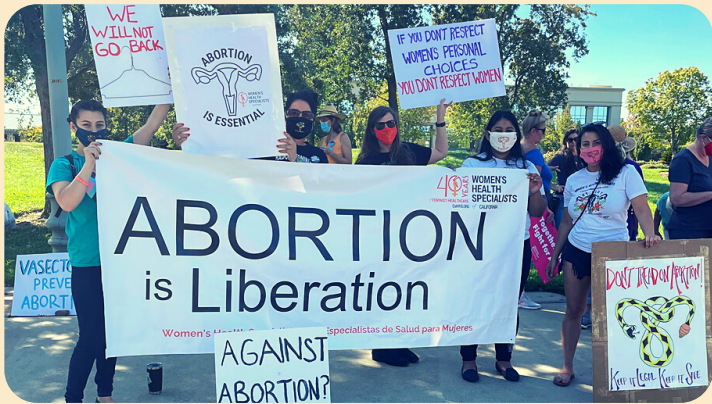
ABORTION JUSTICE MARCH - ABORTION WITHOUT APOLOGY

Women's Health Specialists responded to the attack on abortion in Texas through collective action. On October 2nd, 2021. Staff joined abortion supporters, advocates, and providers in local marches across the Northwest. Women's Health Specialists staff attended events in Redding, Chico, Grass Valley and Grants Pass fighting for abortion without apology.