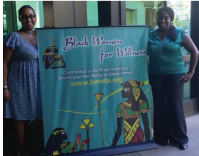
WHS presented a reproductive justice workshop at The "Get Smart B4U Get Sexy" conference convened September 2014 by Black Women for Wellness in Los Angeles.

"Every woman should know this information. This is so important!" Participant at a WHS health class