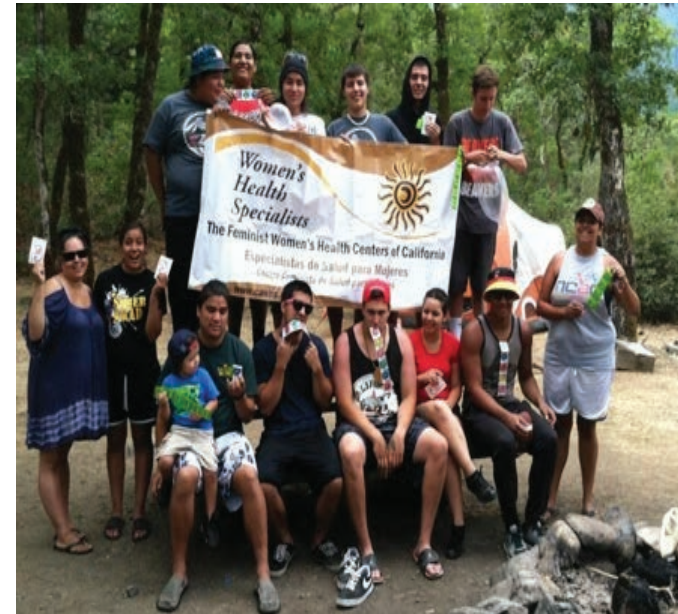
WHS provided educational sessions to youth ages 12-18 attending the July 2014 Tribal Youth Preparedness Cultural Camp at Whiskeytown Environmental Camp, CA.

"Every woman should know this information. This is so important!" Participant at a WHS health class