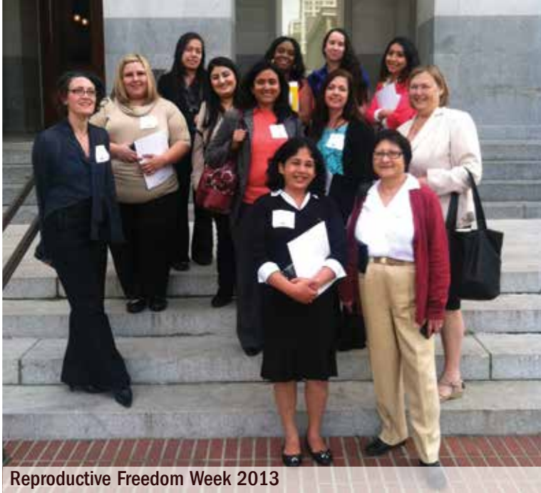
Reproductive Freedom Week 2013