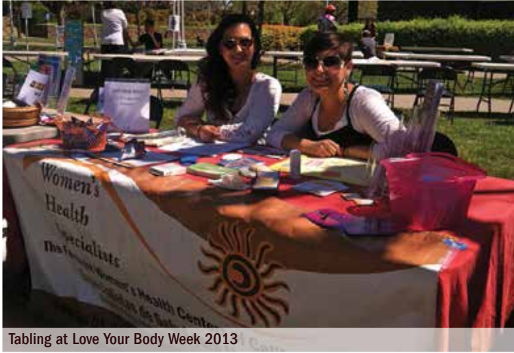
Tabling at Love Your Body Week 2013