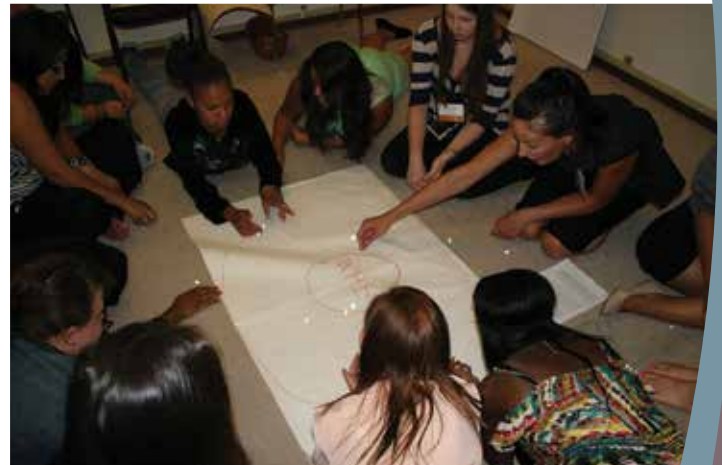
Young Women's Leadership Program 2013