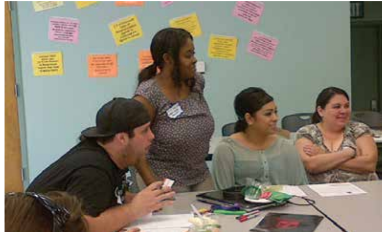
(Standing) WHS' Director of Health Services Conducting an Advocacy Training Session.