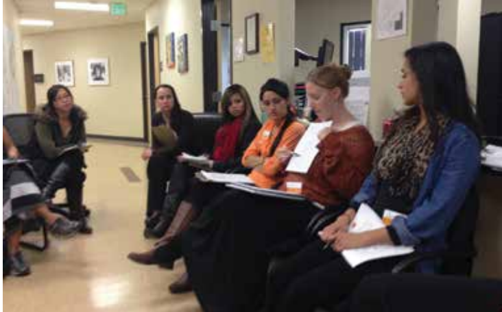
WHS' Training Institute, Sexually Transmitted Infections Session