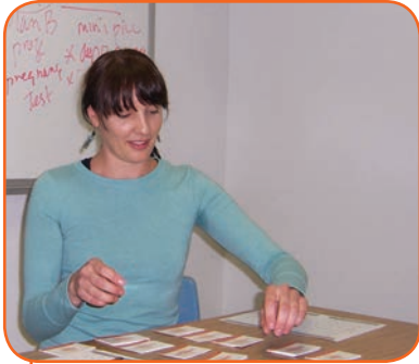
WHS outreach and education staff presenting "Walk in My Shoes," an interactive card game developed by WHS where players experience how difficult it can be to access abortion care

Engaging in events and building authentic relationships with organizations provided WHS with opportunities: