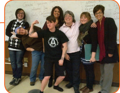
WHS driven Community & Intern Project: Inaugural Gender & Sexuality Panel Discussion participants