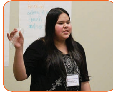
Peer Educator trained by WHS Leadership Program holding a female condom teaches the importance of birth control to a group of her peers

Utilizing strategies, we shared reproductive health information on multiple platforms: