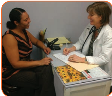
WHS clinic staff at our new Anderson, CA clinic location