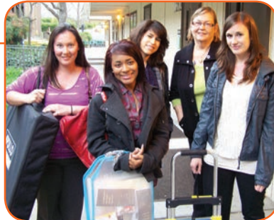
WHS staff at Sierra College for a classroom presentation