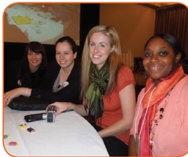
WHS staff at 2012 Reproductive Freedom Day in Sacramento, CA