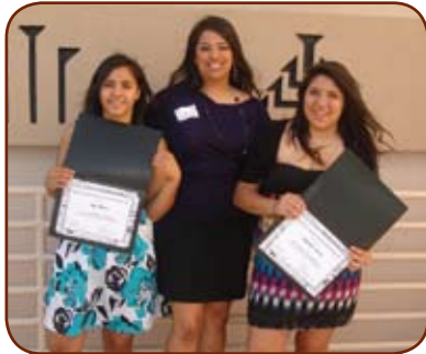
Two WHS Young Women's Leadership Program graduates were recognized as Youth Community Asset Champions by Shasta County Public Health and the Health Improvement Partnership

Engaging in events and building authentic relationships with organizations provided WHS with unique opportunities: