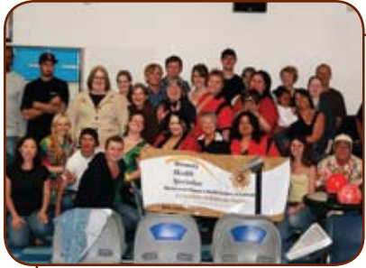
WHS Redding Clinic and WHS supporters at the National Network of Abortion Funds Bowl-A-Thon

Every contribution helps WHS provide reproductive health care to our communities, advance our outreach and education efforts and support women in need regardless of their ability to pay for services: