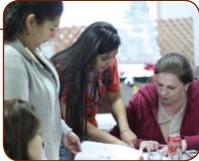
WHS and California Family Health Council conduct a Family Planning training