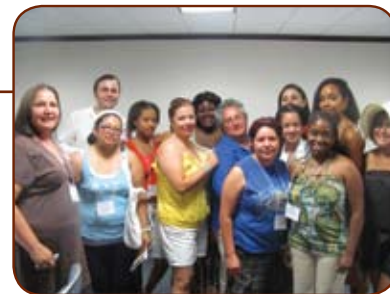
WHS and SisterSong participants attending our workshop "Walk in My Shoes," an interactive card game developed by WHS