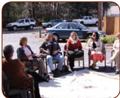
The "Celebrating, Empowering, and Networking" program raises HIV awareness among service providers in rural Northern California