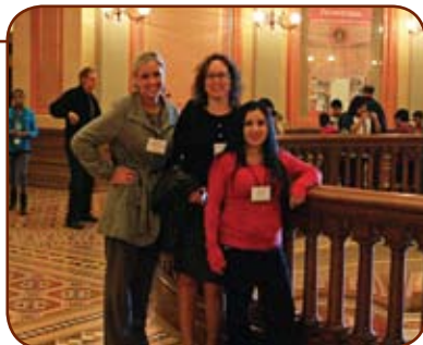
WHS staff at the Capitol 2011