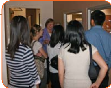
UC Davis students on a guided tour of the WHS Sacramento Clinic