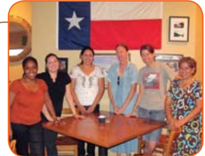
WHS pictured with Migrant Health Promotion Promotoras