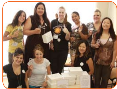
Staff preparing for the Dido Hasper Community Speculum Giveaway Day