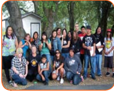
Local Indians for Education Training participants at WHS

Our ability to adapt and quickly respond to community needs is an asset of WHS. In 2009-2010 we responded effectively to community requests for presentations, proposals, partnerships, training opportunities and projects.