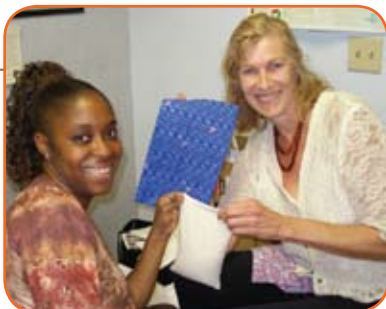
WHS staff making heated rice pads for a fundraiser during the 2009 CA budget crisis