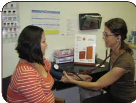
Blood pressure check at The Clinic! in Grass Valley, California