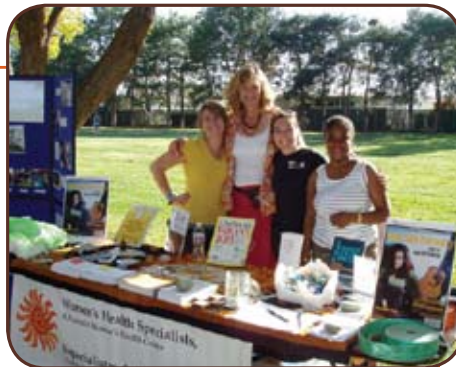
Ani DiFranco benefit concert for WHS sponsored by North Valley Productions

Whether it's our Women in Need Fund, Abortion Access Legal Fund or the Dido Hasper Memorial Fund, your donation is greatly appreciated and tax deductible. You may also want to consider donating to our Women's Health Specialists Endowment through Shasta Regional Community Foundation which was started by Family Planning of Redding. Women's Health Specialists Tax ID #94-2259357