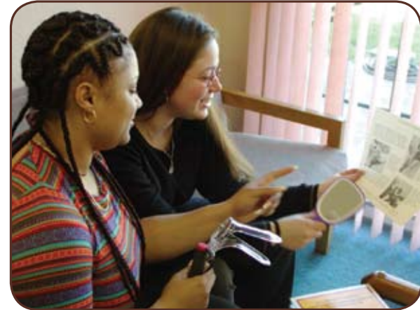
Staff discussing self-examination with a client.