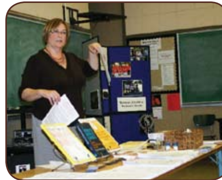
WHS Speaker's Bureau presentation about HPV to college students

In 2008, Women's Health Specialists shared valuable reproductive health care information to over 180,000 community people.