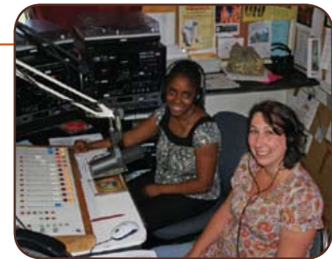
"It's Your Body" radio show team