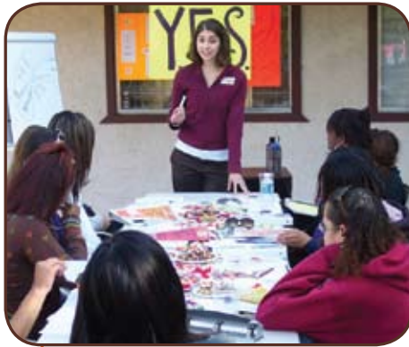
WHS Young Women's Leadership Institute participant involved in a program activity

Community support through contributions of time and money ensures that Women's Health Specialists' health care services and outreach and education programs remain sustainable.