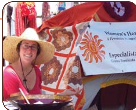
Participating at the Harmony Festival in Santa Rosa, California