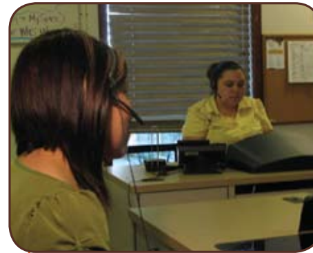
WHS phone counselors providing information, support and referrals