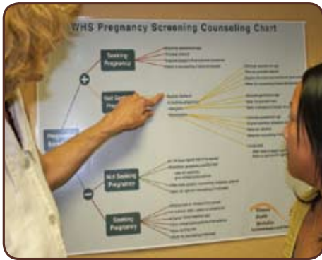
Healthworker training using our Pregnancy Screening Chart