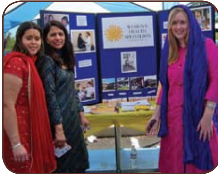
Staff sharing health information at the Vaisakhi Festival

Reaching out to our communities is important to Women's Health Specialists. In 2008 we participated in community events and supported community organizations.