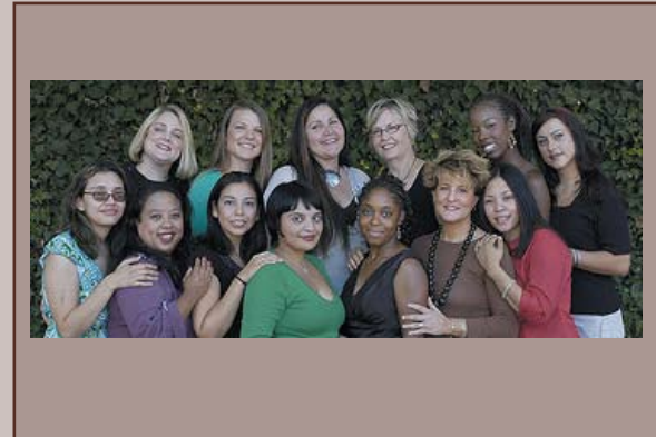
Some of the staff of Women’s Health Specialists, a Feminist Women’s Health Center.