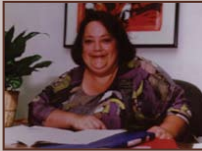
Founding Director, Women's Health Specialists Feminist Women's Health Center

Sister, leader and visionary for Women's Liberation A woman of great vision, great conviction, great courage and great heart.