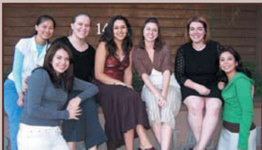
Women’s Health Specialists Phone Counselors shared information with over 150,000 callers last year.

In 2005 Women’s Health Specialists’ phone counselors provided confidential information on health concerns and community resources to over 150,000 women, men and teen callers in English, Spanish and Hmong.