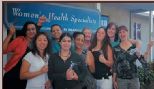
Redding healthworkers waving speculums.