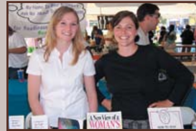
Outreach staff at a community health fair