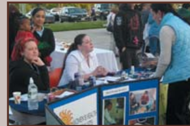
Redding WHS healthworkers sharing information at The Tribal Stomp Community Celebration in Hayfork, CA