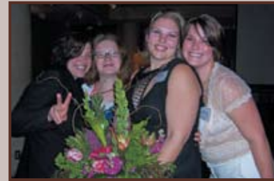
WHS PR team working with interns and volunteers reached 116,448 people in Northern California in 2005