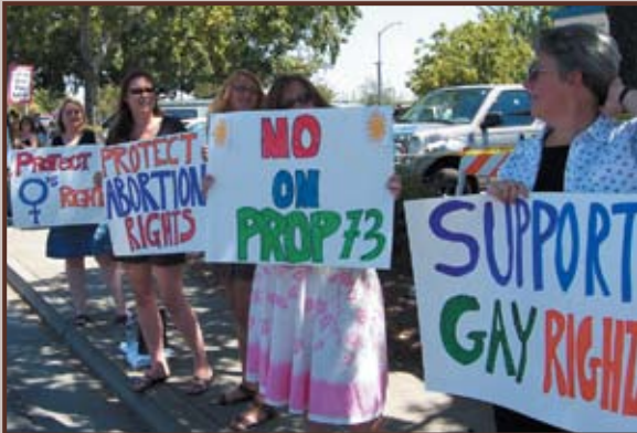
WHS staff & community activists expose the anti-woman Proposition 73, which went down to defeat.

We have a vision: A world where women control their own bodies, reproduction and sexuality. Women’s Health Specialists is dedicated to providing women-controlled health care and advocating all options for all women. Only with dignity and freedom of choice can women achieve their full potential.