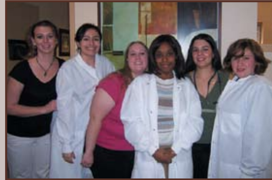
WHS staff in Chico get ready for a day of advocacy and providing health care.

WHS provides confidential testing and treatment and education for all sexually transmitted diseases with a non-judgmental approach for clients and their partners.