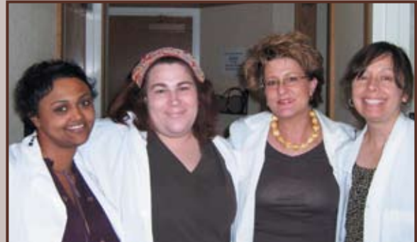
WHS practitioners, healthworkers and management work as a team.

From the first phone call to WHS through the clinic visit, women are offered abortion services with privacy, respect and dignity. WHS offers "The Abortion Pill" in early pregnancy, as well as first and second trimester abortion services. All services include comprehensive follow up and a 24- hour help line.